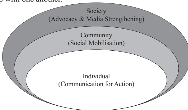
Figure 1: A Socio-ecological Approach to Communication for Development

One of the most-common ways to visually display C4D approaches is through the socio-ecological model of psychologist Urie Bronfenbrenner (1977), who popularised the notion that individual behaviour and action are influenced by environmental and societal forces. The socio-ecological model reminds C4D intervention designers and implementers to always view individuals and communities in context, and in relationship with one another.