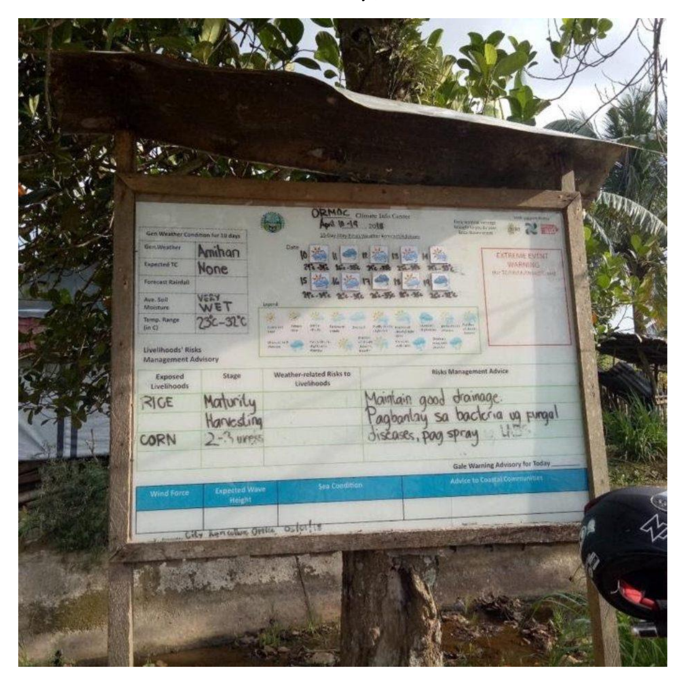
Figure 2: A Weather Board Installed in a Local Community in Ormoc City to Inform Farmers of the Upcoming Weather and Climactic Conditions

In the absence of a climate forecast, the participants use the onset (timing) and amount of rain as a guide in the timing for cultivating their rice fields. As with the findings of Gravoso, Patindol and Predo (2014), farmers in this study start cultivating their rice farms (sowing and ploughing) for the June-October cropping season if these two conditions are met: 1) there is rain towards the end of May, and 2) about one-third of each rice paddy is filled with water. Participants said that their experience of the onset and amount of rain is more reliable compared to the forecasting system involving animals, birds, and insects. "For one, some the birds and insects have become invisible these days," shared a farmer.