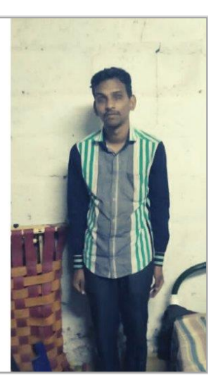
Figure 2: Mobile Vaani Impact Story for Livelihood Support and Working Conditions

received from the IVR and I believe this will help many visually