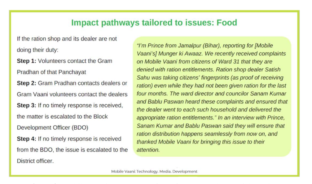
Figure 3: Mobile Vaani Impact Story for Safety Nets and Essential Services

Two major impact pathways existed to address the exclusionary gap in the area of safety nets and essential services. First, Mobile Vaani empowered its marginalized users to record voice reports on poorly functioning public services, and when they had difficulty accessing welfare schemes. Their stories were used by the interstitial STN actors of network volunteers to escalate issues to local government authorities. Many were published on Mobile Vaani to demand social accountability, culminating in smoother provision of these services. Second, the Mobile Vaani volunteers directly assisted many needy families, bringing them immediate relief through online registration for social welfare schemes. They also helped them fix personal data mismatches that precluded them from accessing emergency measures announced by the government. Figure 3 shows one of many impact stories in this area.